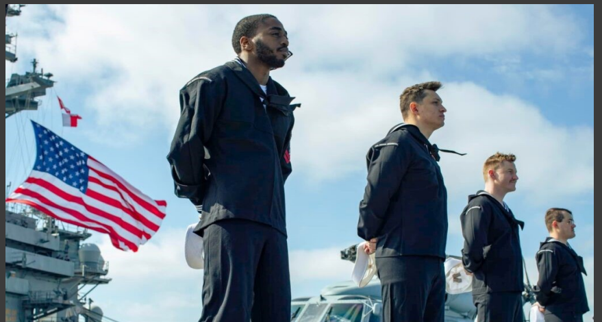
Sailors Aboard USS George Washington (CVN73) Stand on Flight Deck