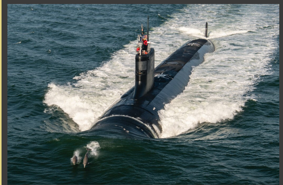
Virginia -Class Submarine New Jersey (SSN 796)