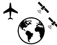
"Active" Ground Layer for Sensing